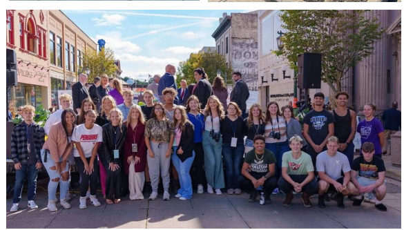
Students visit various historical landmarks downtown, including the ceramic museum. Students from Mr. Davidson's landscaping class beatify the diamond with new plants and mums.